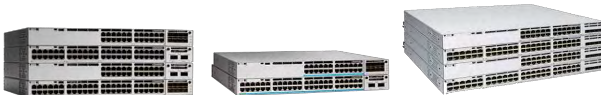
Figure 1. Cisco Catalyst 9300 Series switches

The Cisco Catalyst 9300 Series is made up of nineteen modular uplink switch models and fourteen fixed uplink switch models.