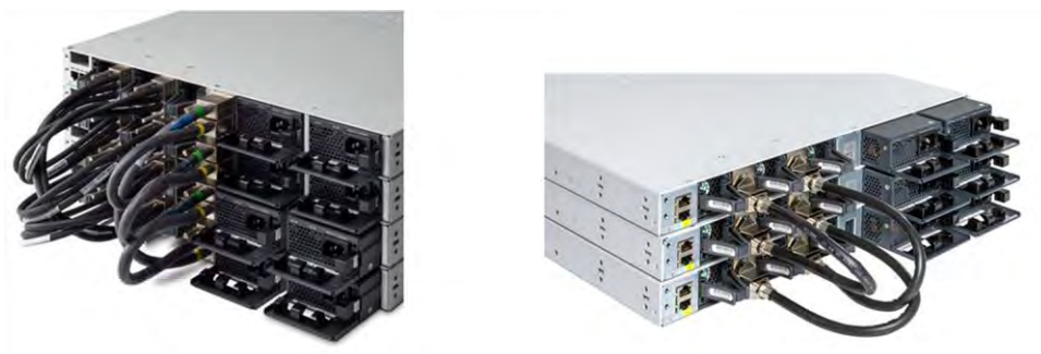
Figure 5. Cisco Catalyst 9300 Series modular uplink models stack (C9300/C9300X SKUs) and fixed uplink models stack (C9300L SKUs)

Cisco Catalyst 9300 Series switch models are designed for stacking switches as a single virtual switch, enabling customers to have a single management plane and control plane for up to 448 access ports.