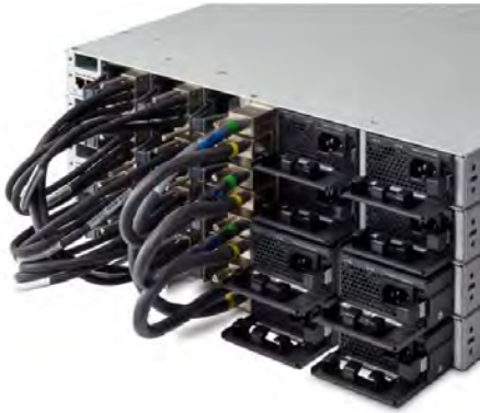
Figure 7. Cisco Catalyst 9300 Series StackPower